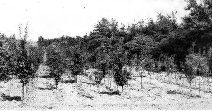
Block of Quercus robur fastigiata